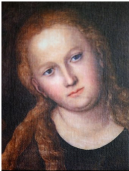
Mary, the mother of Jesus as depicted by the Renaissance's 16th century Lucas Cranach workshop.

The nativity stories recorded in Matthew and Luke are really about God intervening in human history by becoming a real, human baby boy. Martin Luther put it this way: " The virgin birth is a mere trifle for God; that God should become man is a greater miracle. " These Christmas stories are the beginning of the most consequential drama in all human history, God's plan to deliver humankind from sin and death.