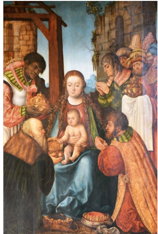
Lucas Cranach, Electoral Saxony's court artist depicted Mary, with the baby Jesus and the visitation by the Magi in this 16th century painting.

GOD. Each of the players in this Christmas story acted according to God's plans for them. They were players in the drama where God intervened in human history by becoming a real, human baby boy. Matthew's Christmas story was the beginning of the Gospel accounts of how God carried out his plan to deliver humankind from their sins .