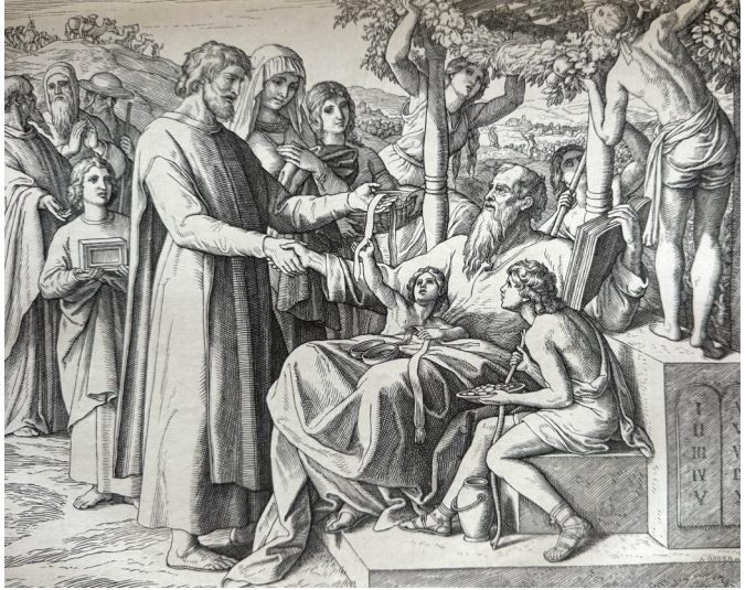
This line drawing titled "Job's New Prosperity" appears in the Haar Family Bible at the end of the Book of Job. It illustrates Job's restoration to wealth and a full family life at the conclusion of the Job Story (v. 42:12) (published in Germany in 1877).

Then the LORD answered Job out of the whirlwind: "Who is this that darkens counsel by <u>words without</u> <u>knowledge</u>?... I will question you, and you shall declare to me. "<u>Where were you when I laid the foundation of the</u> <u>earth</u>? Tell me, if you have understanding. Who determined its measurements—surely you know! Or who stretched the line upon it? On what were its bases sunk, or who laid its cornerstone when the morning stars sang together, and all the heavenly beings shouted for joy?